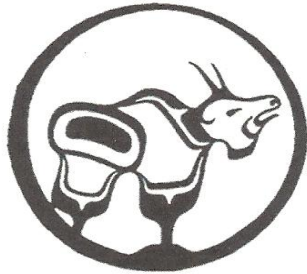
Klahoose First Nation